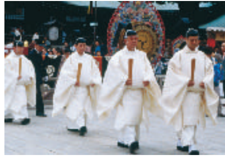
◀ Shinto priests

To honor the kami , the Japanese worshipped at shrines (SHRYNZ), or holy places. There, priests, musicians, and dancers performed rituals for people who asked the